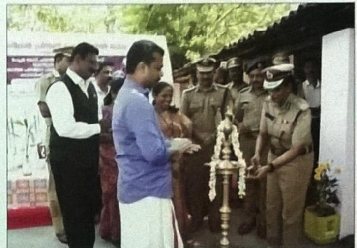
Smt. R. Sreelekha IPS, DG of Prisons and CS lighting the lamp during the inaugural function of new manufactory units at Central Prison & Correctional Home, Thiruvananthapuram, Kerala. Sri. V.K. Prasanth, Mayor, Thiruvananthapuram is also seen in the picture.

Thiruvananthapuram : Continuing the progressive move towards effective rehabilitation and reintegration of prisoners, the Kerala Prisons department initiated few new manufactories and skill development programs at the Central Prison and Correctional Home, Thiruvananthapuram. Manufactory units for paper bag making and file board making and screen printing unit were inaugurated by Sri. V.K. Prasanth, Mayor, Thiruvananthapuram Corporation on 19 th June 2017. A new training program to impart driving skills was inaugurated and distribution of certificates to those who have completed vocational training was also conducted. Smt. Sreelekha IPS, DG of Prisons and CS, presided over the function. Sri. B. Pradeep, DIG Prisons & Director, SICA, Thiruvananthapuram, and Sri. S. Santhosh, Superintendent, Central Prisons & CH were also present during the occasion.